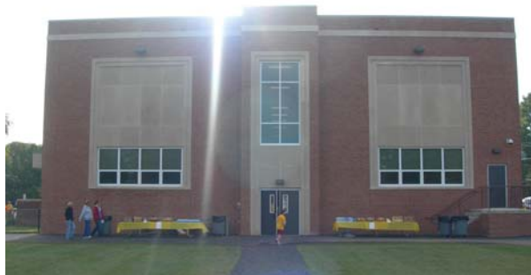
York Avenue Elementary School

493 E. Main Street Lansdale, Pa 19446 215-368-0995 www.ststanislaus-lansdale.catholicweb.com